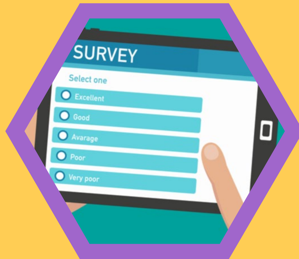
Survey* 87 Respondents (2020)