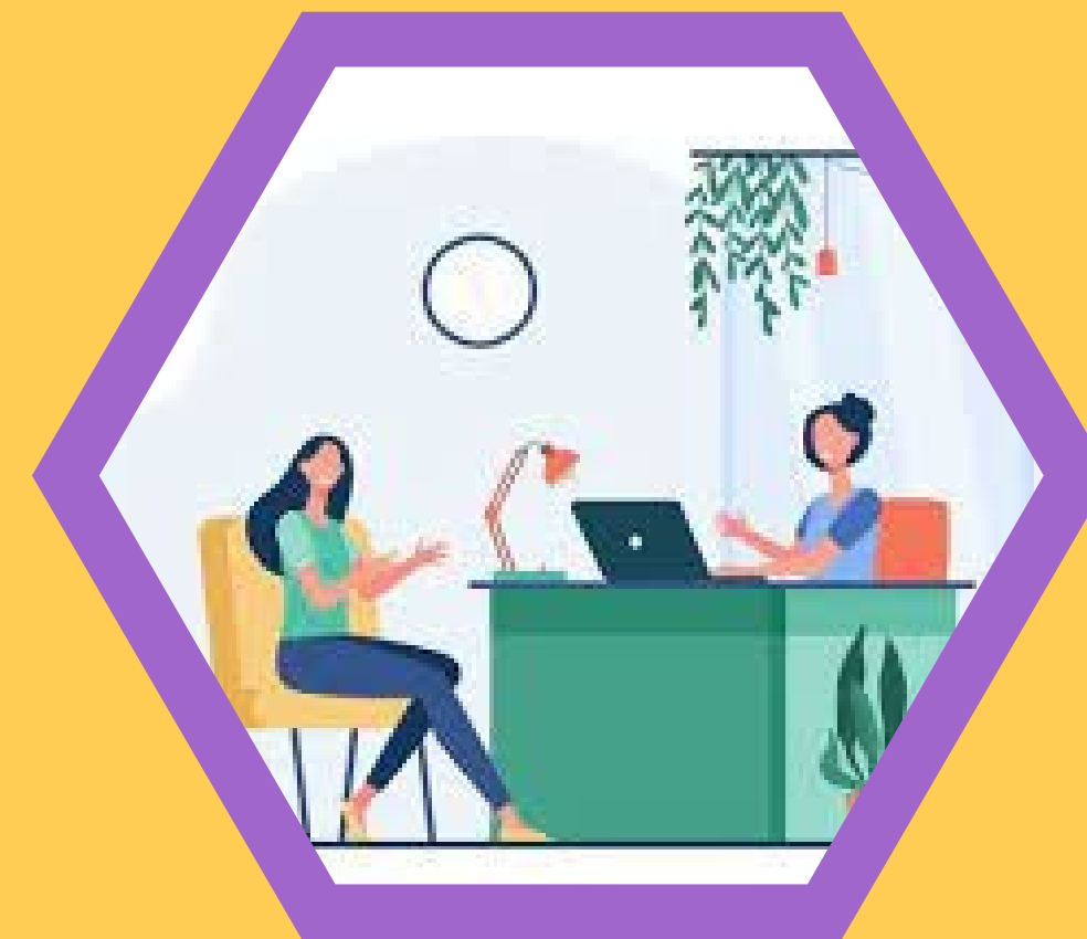
Key Informant Interviews 11 Interviews (2022)