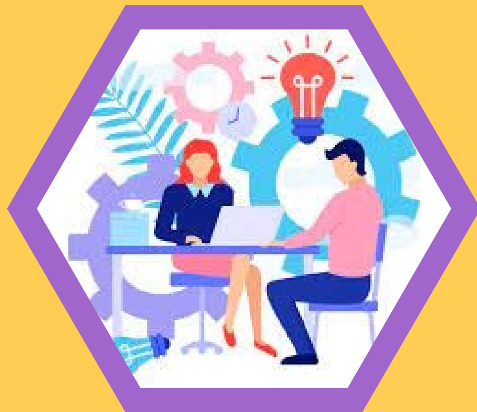
Key Informant Interviews* 8 Interviews (2020)